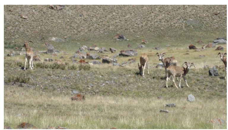
Young males of Tien Shan argalis

Camera trap (n°15): unfortunately stopped working after 2 weeks, triggered by the cliff shadow, apparently no animals on the recordings except a Large-eared pika ( Ochotona macrotis ).