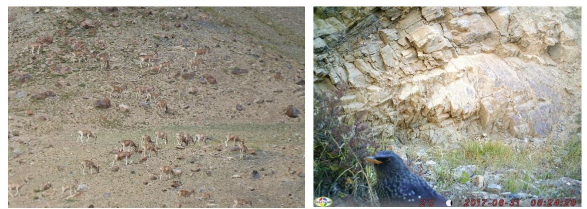
Female Tien Shan argalis and a Blue whistling thrush on camera trap

Camera trap (n°17) checked (around 5000 pictures, Fox, Blue whistling thrush ( Myophonus caeruleus ) and Marmots, triggered by a shrub) and maintained in front of Oroï suu area. Observations: 10 to 15 feces of Bear were found at the same place, old Bear scrapes and an old Snow leopard scrape.