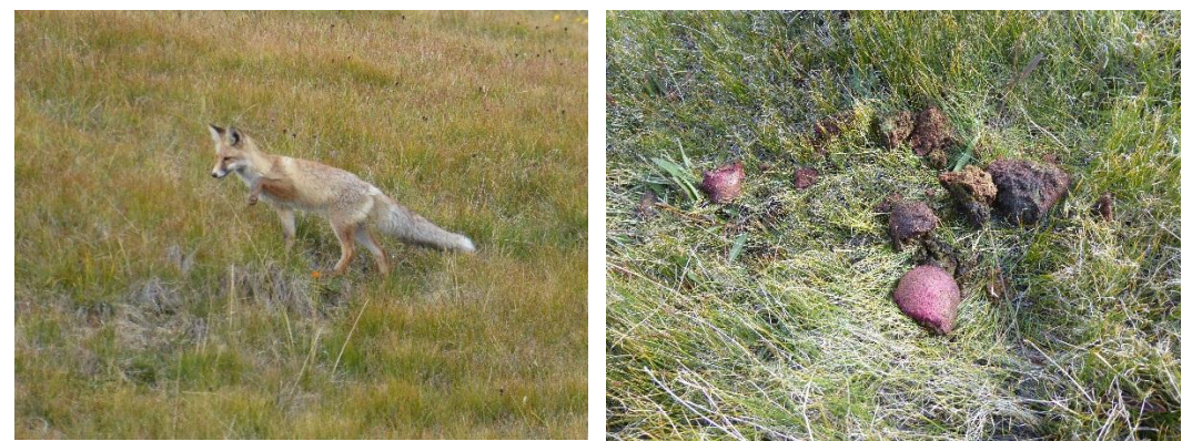
Fox hunting rodents and really fresh Bear feces.

Observations : one young (1 to 3 years) Golden eagle ( Aquila chrysaetos daphanea ) that flew low over the camp, one fox hunting rodents (very close and during a long moment); collection of the <u>first sample</u> of snow leopard feces, next to a scrape; footprints and feces of wolves near the lake, very fresh feces of Bear ( Ursus arctos isabellinus ) near the crest and eight Hill pigeons ( Columba rupestris ). One dying Grey marmot ( Marmota baibacina ) in its hole at camp.