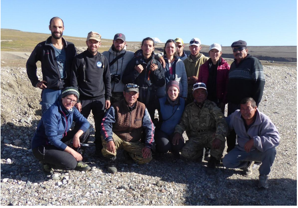
The europeano-kyrgyz team !