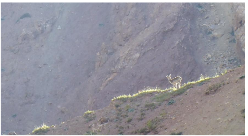
Female of Tien Shan argali

Observations: 1/ narrow valley on the left bank - 2 scrapes and a pug mark of Bear; Wolf markings (old feces, old pug marks); 2/ group of boulders on the slope of the Ortho Bordu crest, at the eastern end of the valley (right bank) - old track of Snow leopard; on the way - Bear diggings into marmot holes, 30 female Siberian ibexes and 46 female Tien Shan argalis.