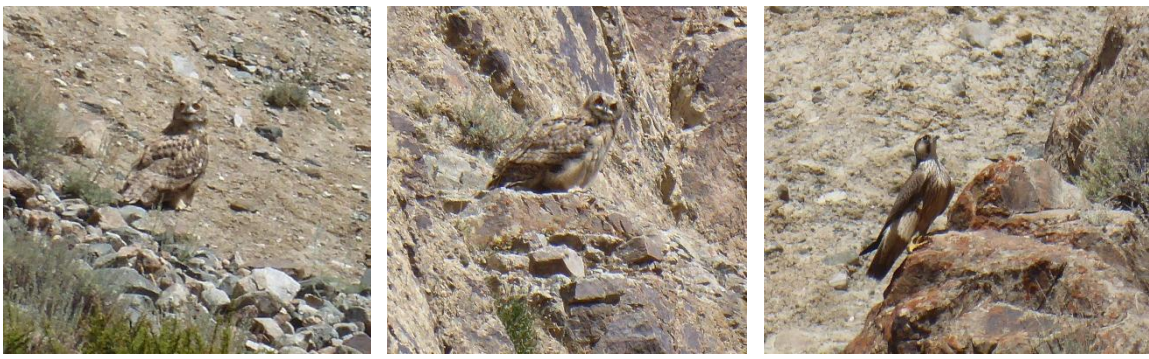
Eurasian eagle owl (adult and young) and Eurasian hobby

Observations : 31 female Argalis with youngs at the entry of the valley; scrapes and footprints of Bear; one scrape, two fresh feces (<u>2 samples taken</u>) and urine of Snow leopard in the lowest part of the river, one Güldentstädt's redstart.