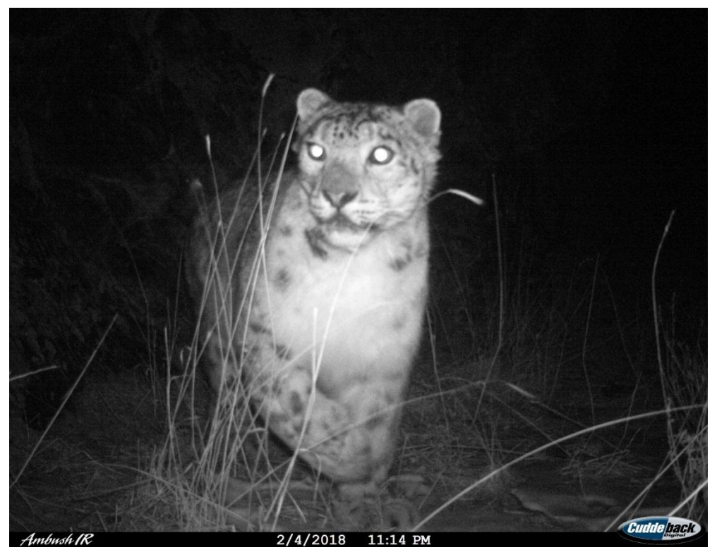
Snow leopard captured on Kizil Keregue and Tchong Koilu camera traps