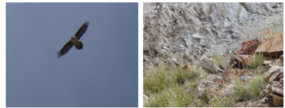
Lammergeier and Himalayan snowcock

Observations : lots of feces of Snow leopard (<u>3 samples taken</u>); 2 Golden eagles, 3 Lammergeiers (two adults and one young), one female Himalayan snowcock with 15 juveniles ( Tetraogallus himalayensis ), one Sand martin (?), one Isabelline wheatear ( Oenanthe isabellina ), several female of Tien Shan argalis with youngs;