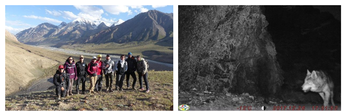
Team at the bottom of Ortho-Bordou and Wolf on Boroko camera trap

Camera trap (n°7) : on the way, stop at Boroko; 8000 pictures were recorded, apparently one photo every 58 minute; after checking, pictures of Siberian ibexes, Snow Leopard ( Panthera uncia , including a mother and cub), Fox and Grey wolves ( Canis lupus ) were recorded.