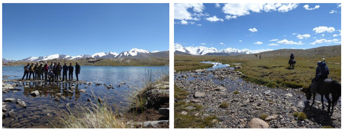
Lunch at the lake and way back to Kumtor

Observations: at the camp – again the hermine; on the way - one fox (that could be seen every day around the camp); at the lake – 2 Common sandpiper ( Actitis hypoleucos ), one duck (diver, Aythya sp?), 3 Ruddy Shelducks, one adult Lammergeier, and 3 female Tien Shan argalis on the shores; on the way - foxes, 2 Ruddy shelducks, about ten female Tien Shan argalis and 3 another time, Marmots.