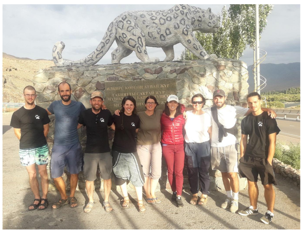
On the way back to Bishkek