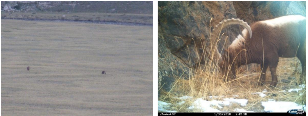
2 Bears hunting Marmots and a Siberian ibex male on camera trap

Observations : Snow leopard feces (<u>2 samples taken</u>), several Wolves feces, one Golden eagle, a Sand martin (?), in the evening, in the plains south of the camp, 70 argalis (58 females, 12 youngs) and 2 Bears hunting marmots at dusk in plains at the junction of the rivers (probably a female with an old cub).