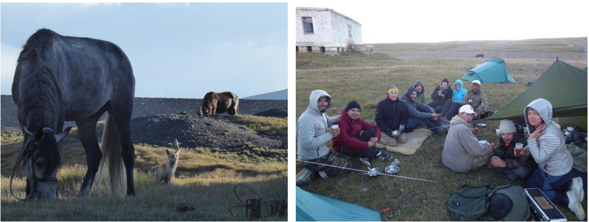
Fox and dinner at 4000 m above sea level